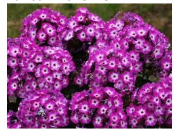
Full sun Zone 4-8