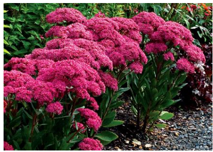
Full sun Zone 4