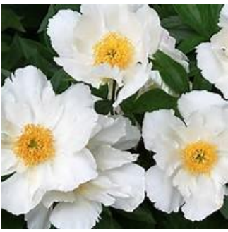
Grows 2 ½ to 3 feet tall. Sun Zone 2